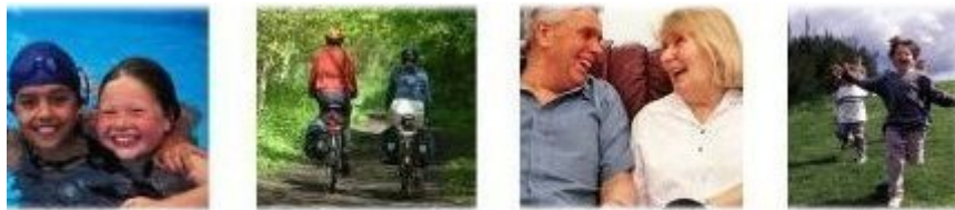
Shropshire Community Directory

The directory is available online at www.carechoices.co.uk and www.shropshire.gov.uk it can also be accessed in spoken word through www.browsaloud.com or request a copy by calling 0345 678 9044.