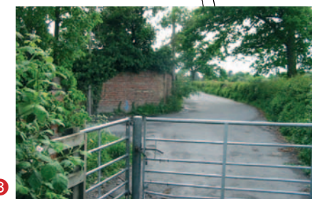
Gateway at end of track at point 8