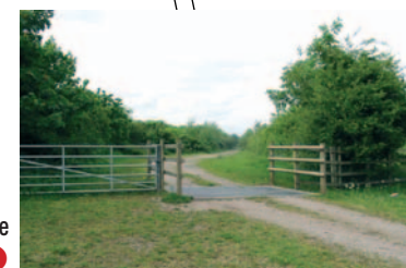
Start of track just before underpass 7