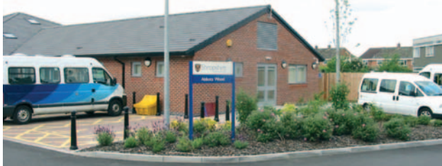
1 Start and finish at Abbots Wood