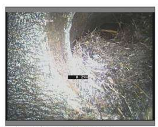
Photo: 31_3A, Media No:: 290819_1, 00:00:19 0.29m, Survey abandoned Remarks: Unable to pass root mass - root cutting required