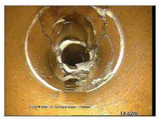
Photo: 72_10A, Media No:: 290819_1, 00:01:46 14.62m, Fracture, multiple, from 9 to 5 o'clock