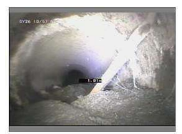
Photo: 69_3A, Media No:: 290819_1, 00:00:29 0.98m, Settled deposits, fine, 40% cross-sectional area loss