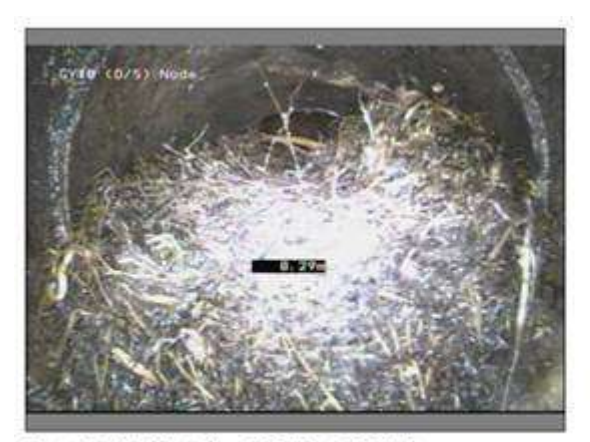
Photo: 31_3A, Media No:: 290819_1, 00:00:18 0.28m, Roots, mass, 60% cross-sectional area loss

Shropshire Council have undertaken initial investigations at one location (Albrighton). Substantial structural damage to the drainage system was clearly evident. It is expected that similar damage will be found in the systems more widely and will be confirmed as part of this project.