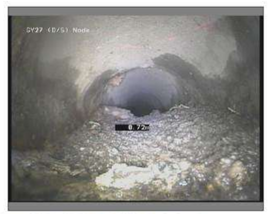
Photo: 70_3A, Media No:: 290819_1, 00:00:41 0.72m, Settled deposits, fine, 45% cross-sectional area loss