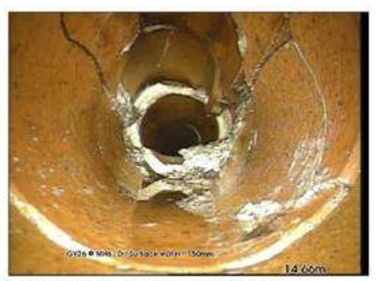
Photo: 72_12A, Media No:: 290819_1, 00:01:58 14.66m, Broken pipe, from 9 to 3 o'clock Remarks: Excavation required to repair