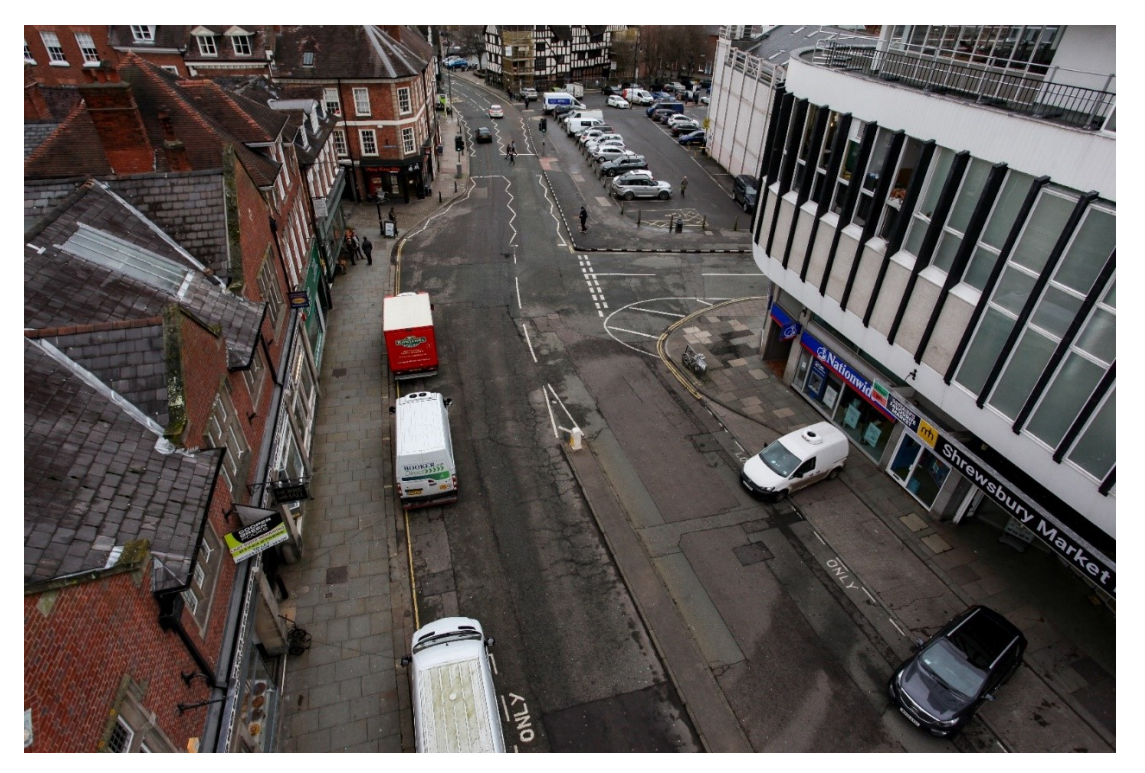
Bellstone February 2020