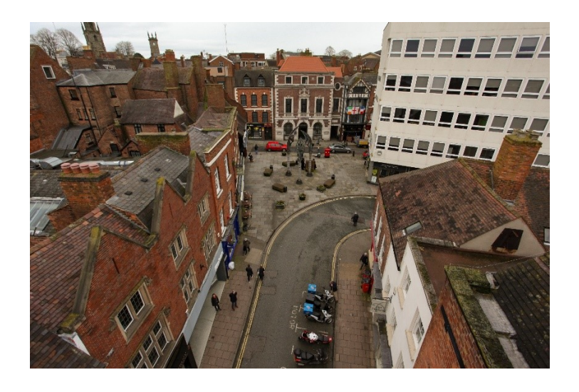
Mardol looking to Darwin's Gate February 2020