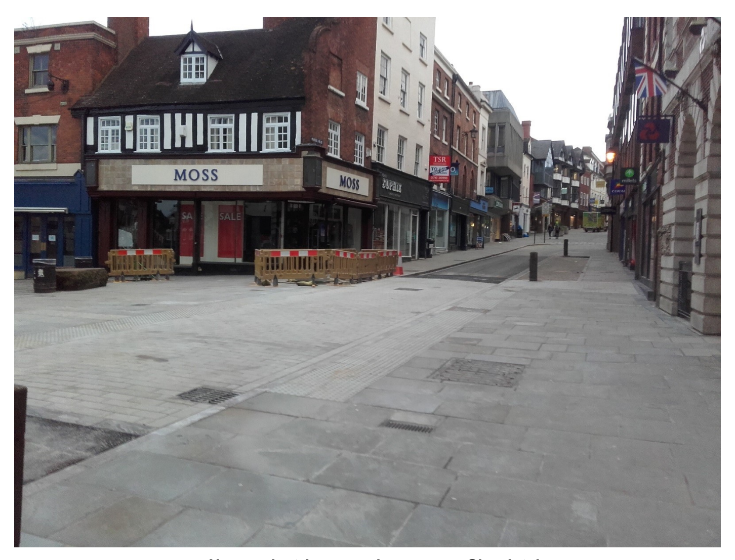
New pedestrian crossing area on Shoplatch

Footways were re aligned through this location and a raised table formed to create an improved, level, designated crossing area for pedestrians.