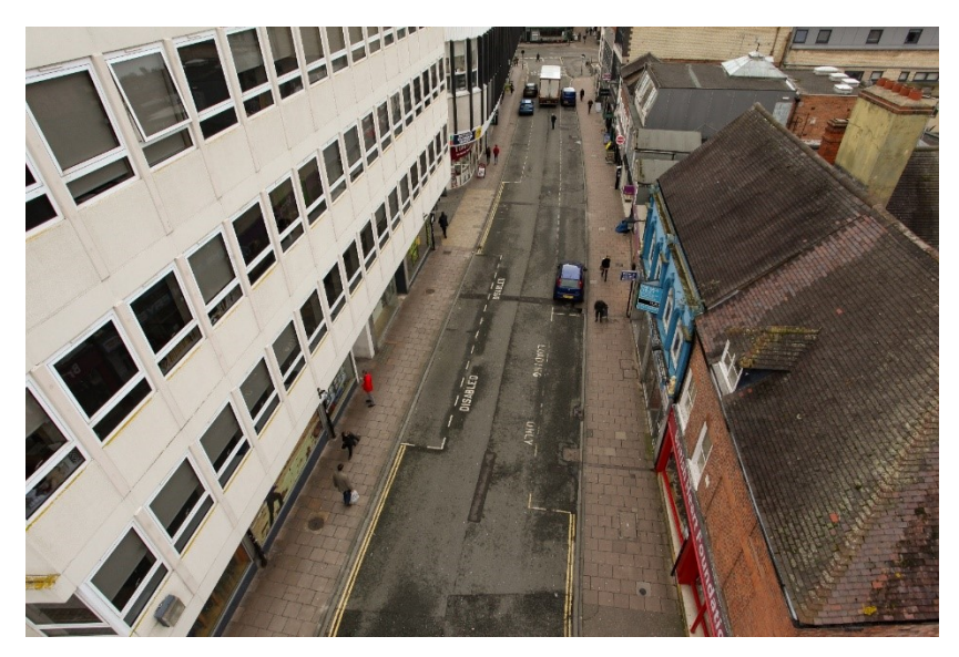
Claremont Street February 2020