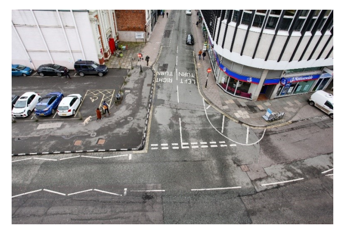
Bellstone/Barker Street/Claremont Street February 2020