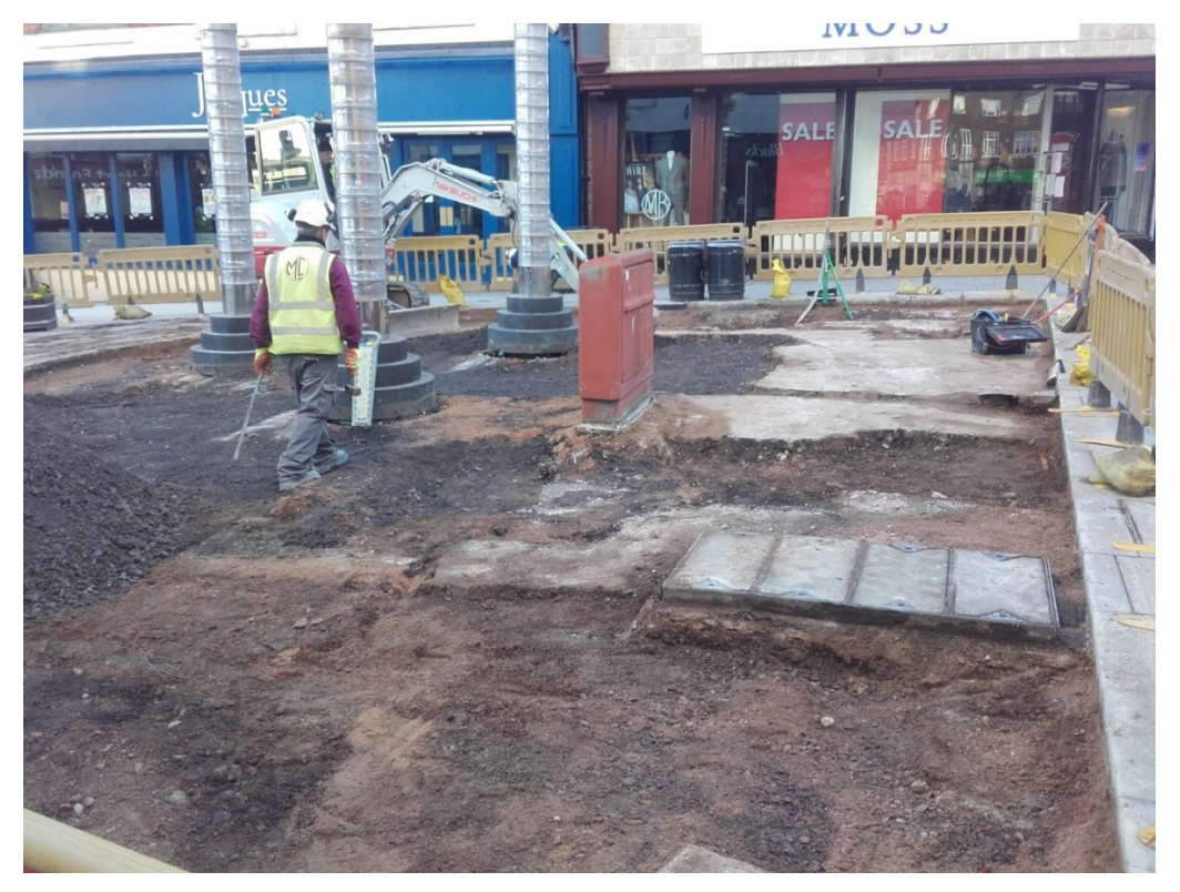
Excavating Darwin's Gate Square to prepare for new granite paving