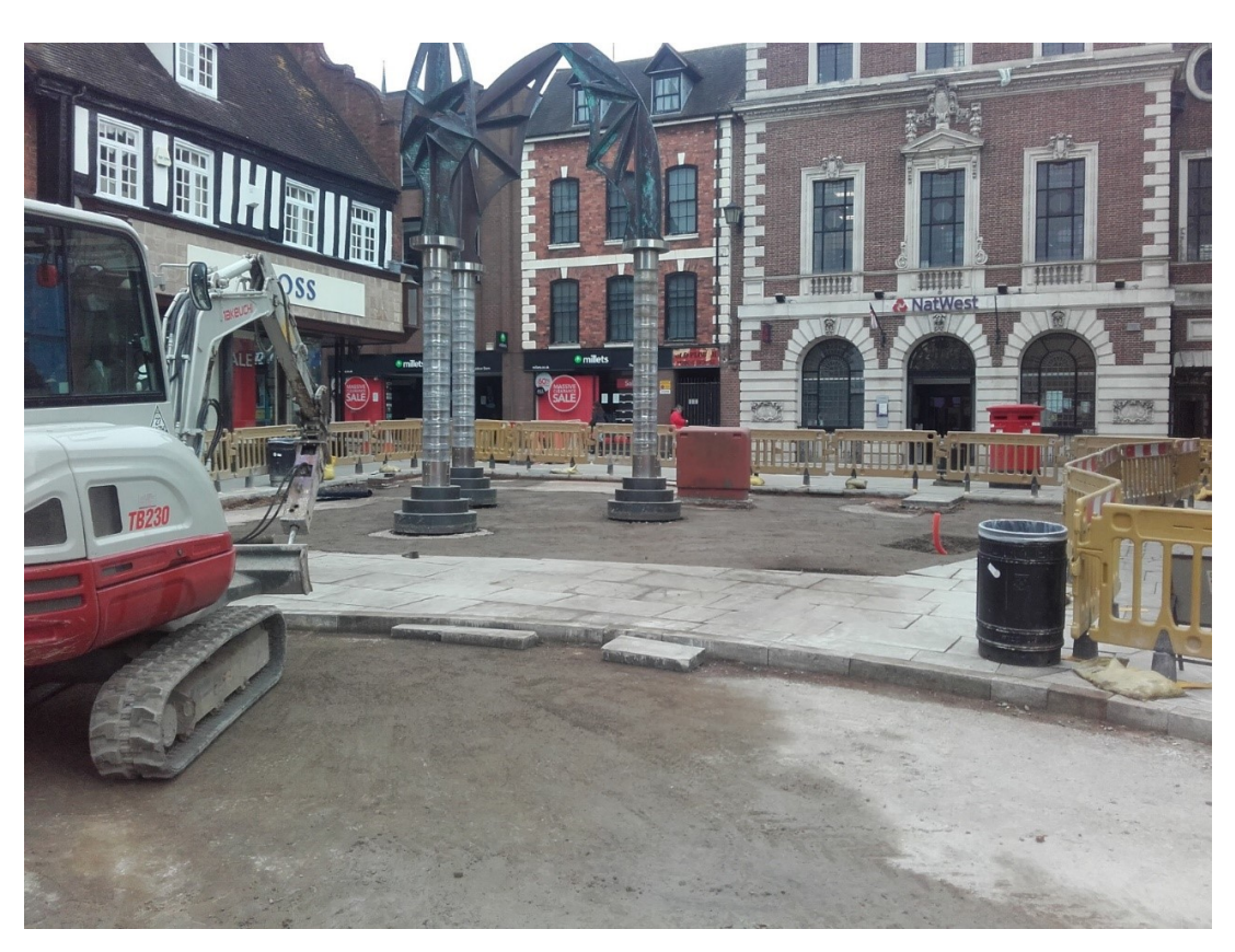
Concrete sub base laid in Darwin Gate Square