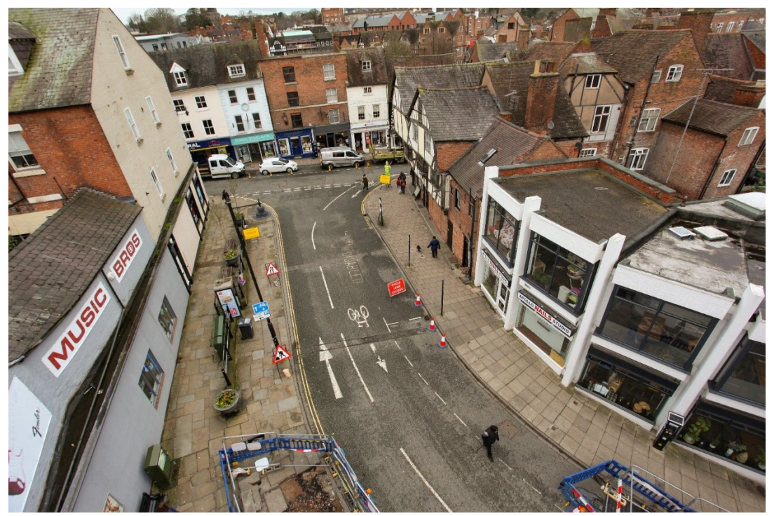
Roushill/Mardol junction February 2020