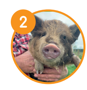
Our most recent arrivals have been 3 beautiful Kunekune pigs, they are very friendly and provide a therapy role together with our Wiltshire cross Dorper sheep