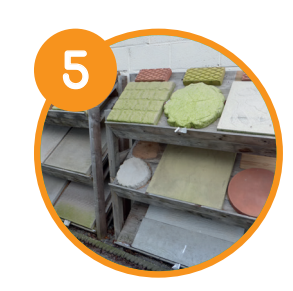
Our concrete workshop is a long established facility offering a range ofpaving slabs, edgings, tiles and other decorative items for sale to the public.