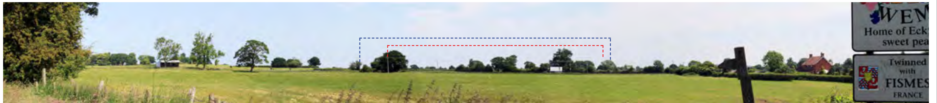
Wider Context View