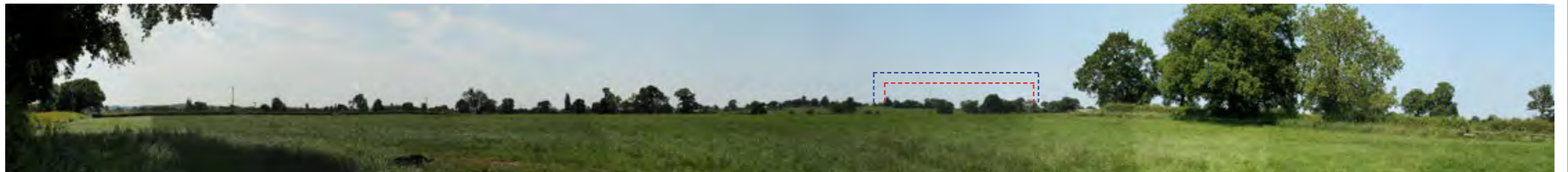
Wider Context View