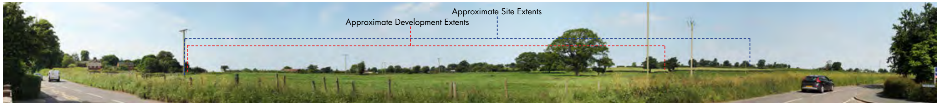
Representative Viewpoint 01: View from junction with Lowe Hill Road & Pyms Road looking west on the site boundary

Approximate Development Extents Approximate Site Extents