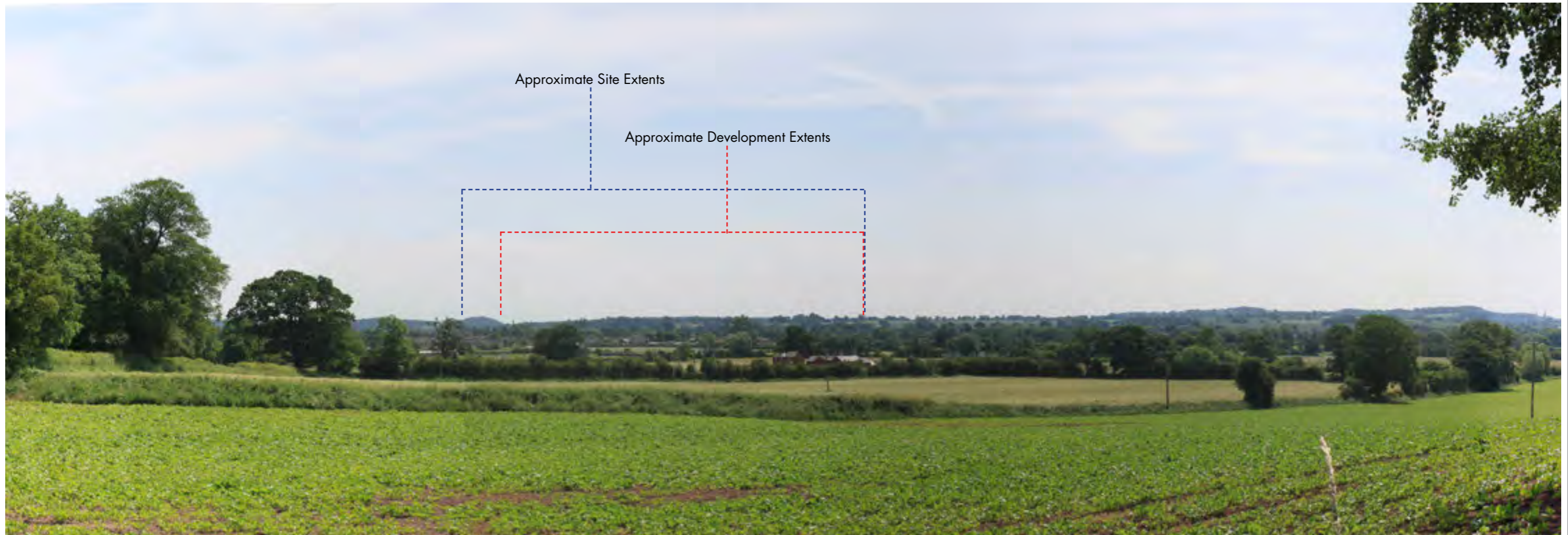
Representative Viewpoint 05: View from footpath 0230 47/1, looking east towards the application site