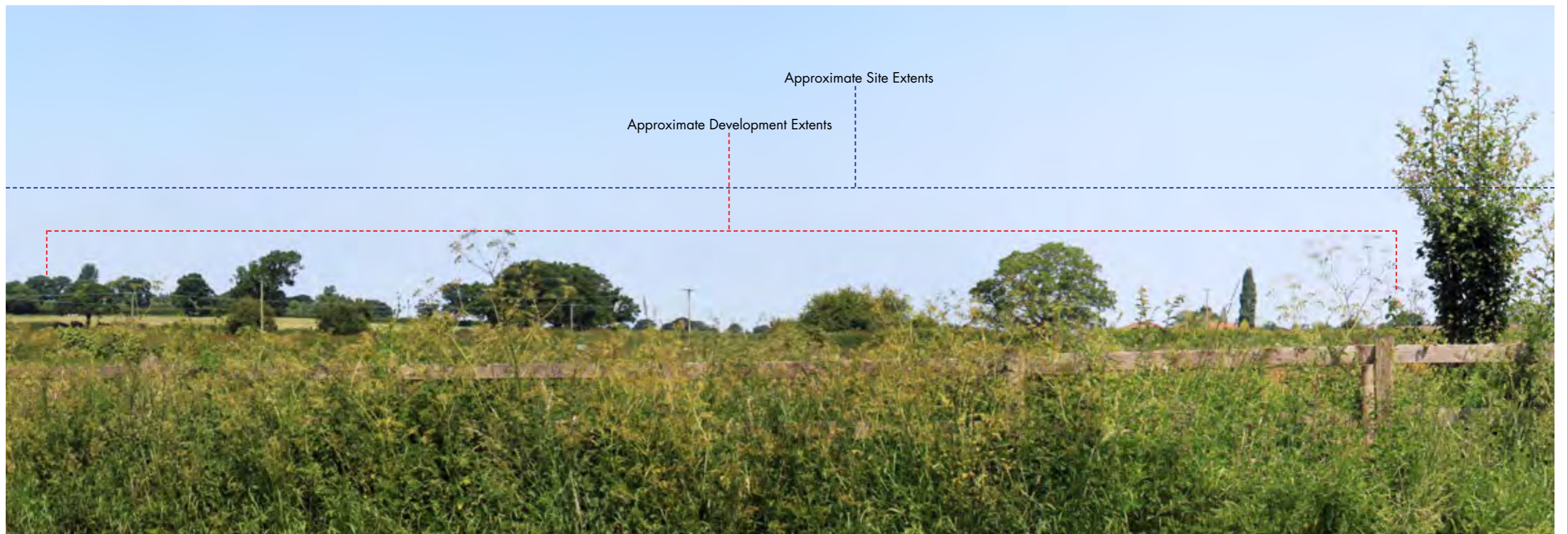
Representative Viewpoint 07: View from Ellesmere Road, looking north to site