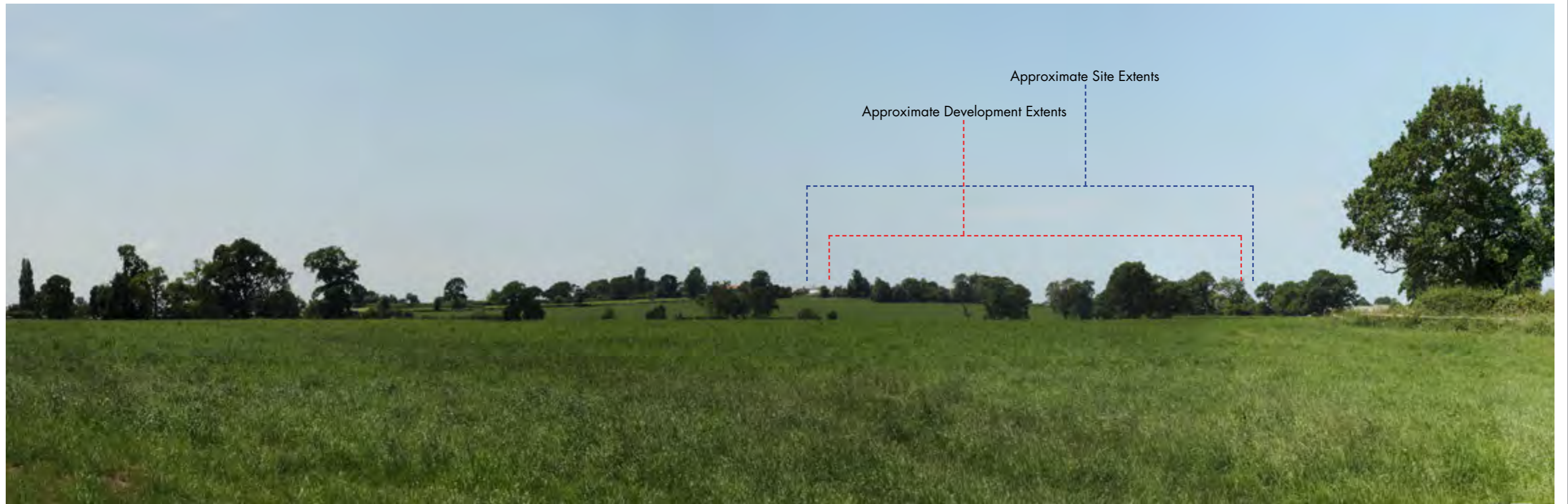
Representative Viewpoint 09: View from footpath 0230/1 The Shropshire Way, looking south west towards the application site