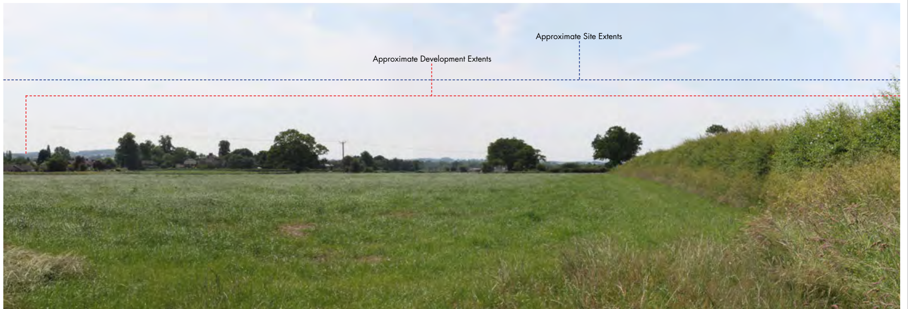
Representative Viewpoint 08: View from Lowe Hill Road, looking south towards the application site