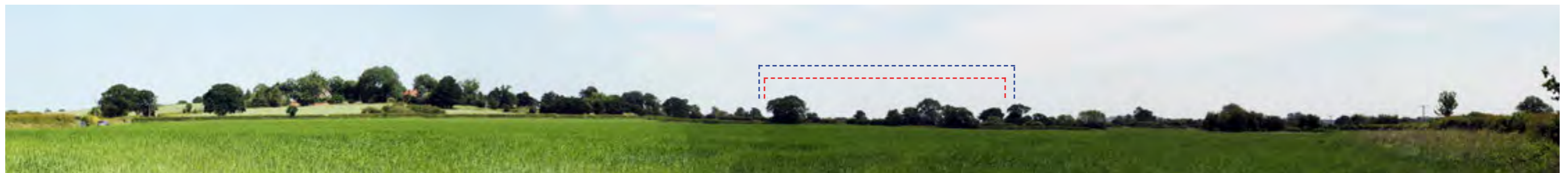
Wider Context View