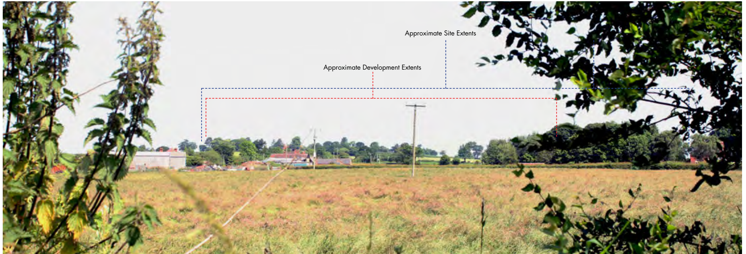
Representative Viewpoint 02: View from footpath 0231 47/1, looking north towards the application site