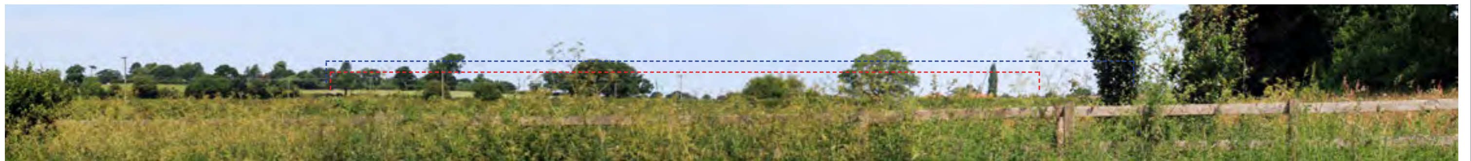
Wider Context View