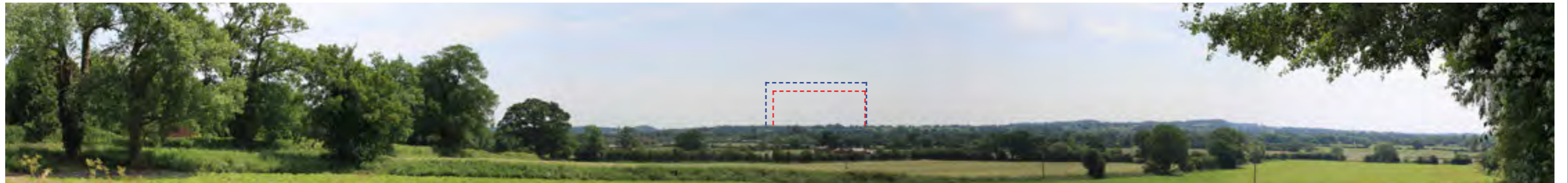
Wider Context View