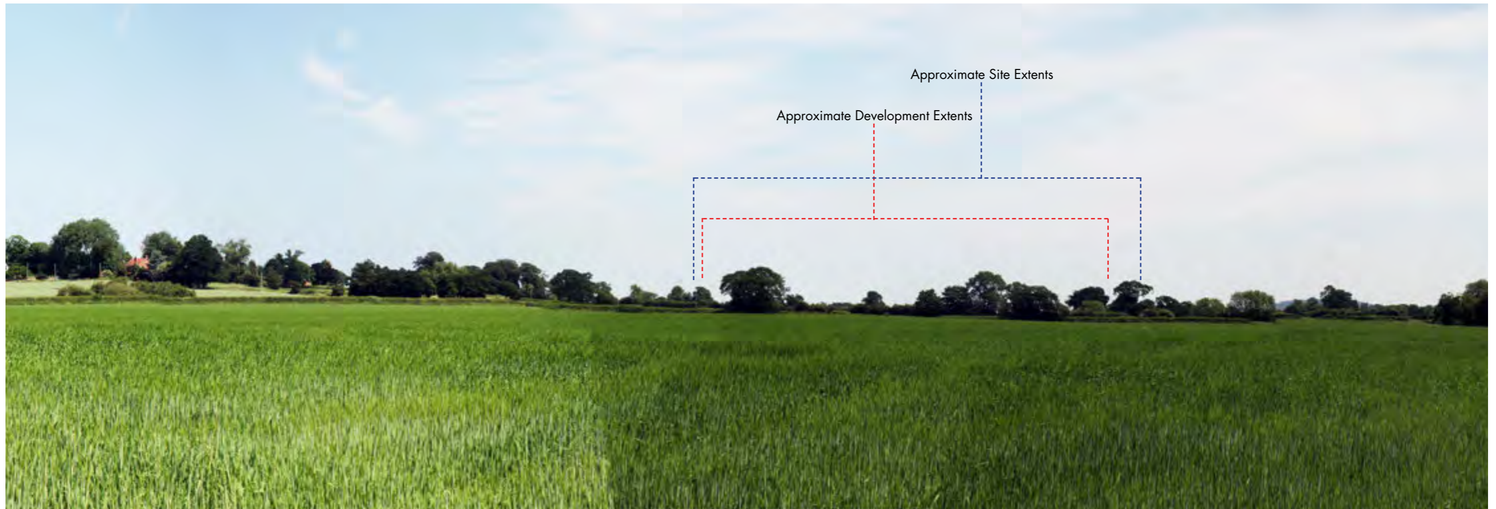
Representative Viewpoint 04: View from footpath 0230 47/1, looking north east towards the application site