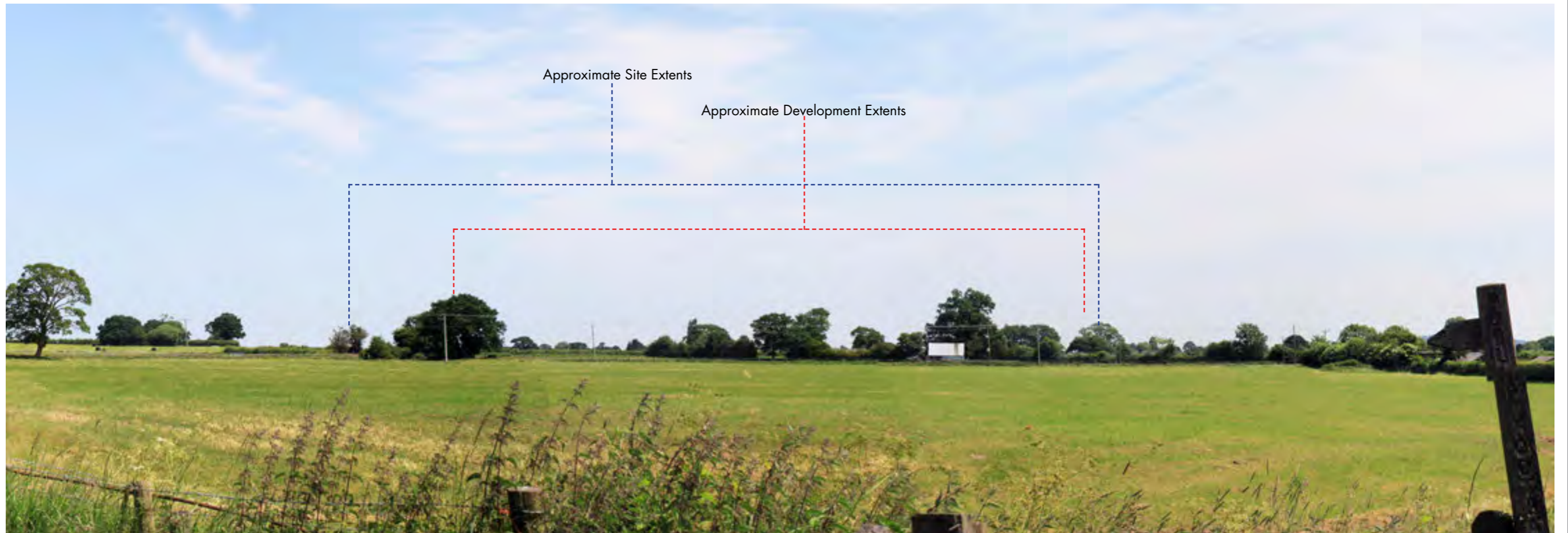
Representative Viewpoint 06: View from Ellesmere Road, looking north east towards site