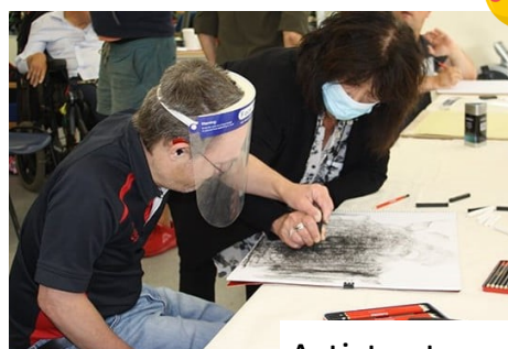
Artists at work!