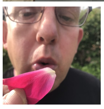
Albert Road says Thank you all for a lovely day at Abbots Wood.