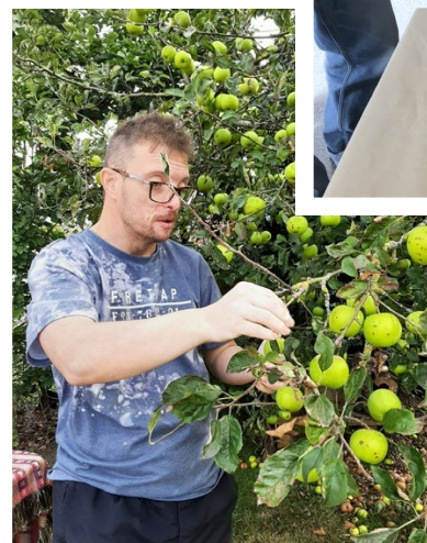
Thanks for letting us have some apples, we made crumble!