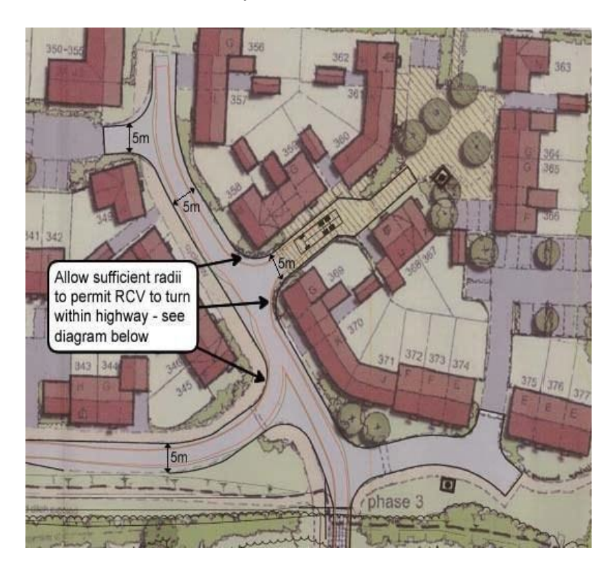
Example vehicle tracking plan. Orange lines indicate vehicle route

The width of any road where the RCV is expected to access will need to be a minimum of 5 metres, this will allow single side parking and the RCV to pass without hindrance. Consideration must be given at the initial design stage for the provision of adequate off-street parking in safe and convenient locations for residents to minimise parking within the street. Where developments are designed to have on street parking on both sides of a road, the minimum road width would need to be 8 metres. The RCV will only travel along roads that have been constructed to Council's adoptable standards.