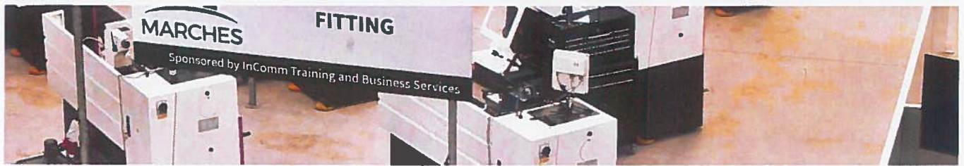
Marches Centre of Manufacturing and Technology

The Marches Centre of Manufacturing and Technology (MCMT) said it will continue to work with companies in Bridgnorth, focusing on their apprentices, consultancy and up-skilling.