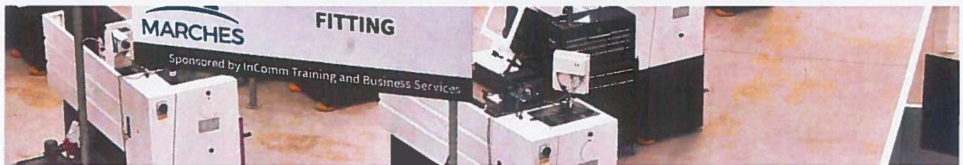
Marches Centre of Manufacturing and Technology

Marches Centre of Manufacturing and Technology (MCMT) hopes to move into its new site in Telford by September, and has listed its current venue on Stanmore Business Park up for rent.