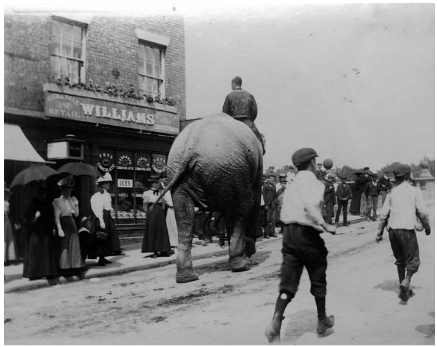
SHYMS: P/2005/2751 Glass Lantern Slide