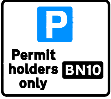
Sign type CS3 next to bay