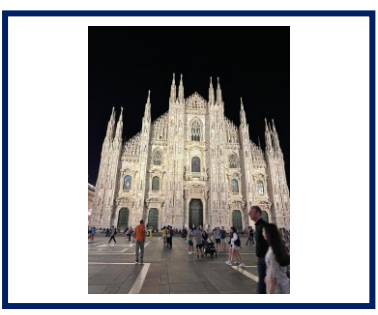
Eliza completed a roof top tour of the Duomo in Milan.

www.shropshire.gov.uk General Enquiries: 0345 678 9000