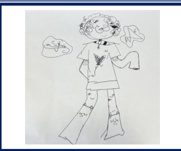
Wren has used her artistic talents to create a wonderful character named 'Sugar'.