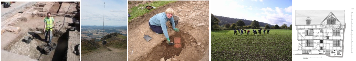
From l-r: Excavations at St Austin's Friars, Shrewsbury; Photographic recording at The Wrekin; Excavations at Acton Scott; Fieldwalking at Alcaston; East elevation of The Reader's House, Ludlow

We maintain full records on desk-based and field-based investigation in the county and are the repository for archaeological fieldwork and historic building investigation and recording carried out in the county. This is often as a result of development projects, and includes a wide range of material related to the intervention history of heritage assets across the county.