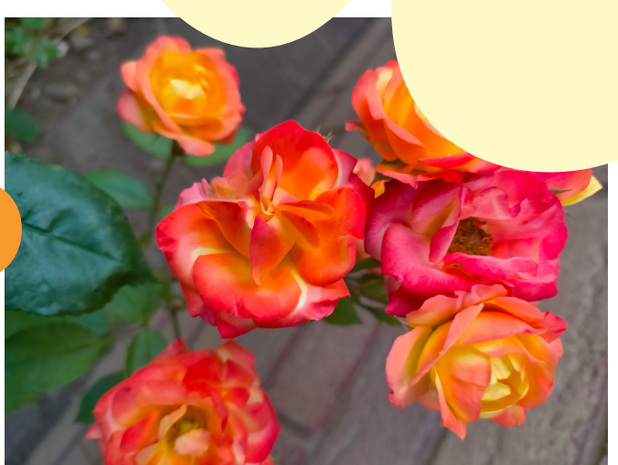
Plants which are toxic to humans

Several species commonly known as jimson weed, thorn apple, stinkweed, Jamestown weed, angel's trumpets, moonflower, and sacred datura.