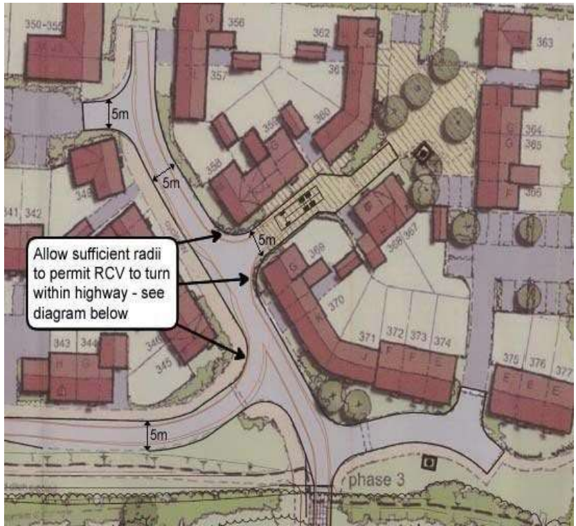
Example vehicle tracking plan. Orange lines indicate vehicle route