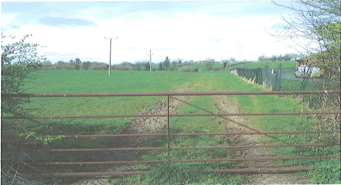
The site is pictured above looking from the road, as you can see the site is agricultural fields and is largely unspoilt.

open it suffered from groundwater flooding which altered the composition of the earth, there is also faulting in the bedrock a few thousand yards from the site. In the Orchard Lane area of the village there are several clay pits where clay was extracted for the production of bricks at the Brickworks in Cruckmeole. These recent disturbances in the ground increase the risk of future mass movement of the ground which are unpredictable and can have devastating consequences. The ground's stability is in a delicate balance if any increase in weight (from housing) or change in the recharge of groundwater (from impermeable surfaces) is altered then the ground could easily subside or move as the village is in a valley, so can be effected by very slight changes to the environment.