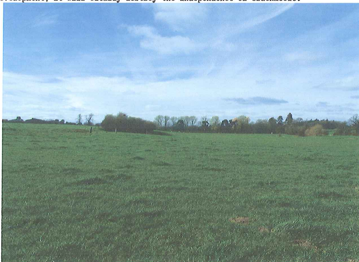
This photograph shows the fringes of the development, floodwater from the Rea brook has reached this far before as it is on a flood plain.