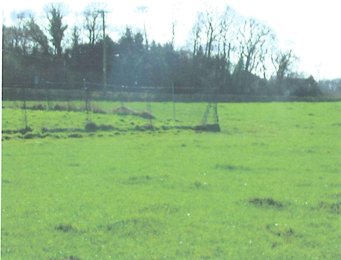
This photograph above is a close up of the exact centre of the proposed development, it will clearly destroy the independence of Cruckmeole.